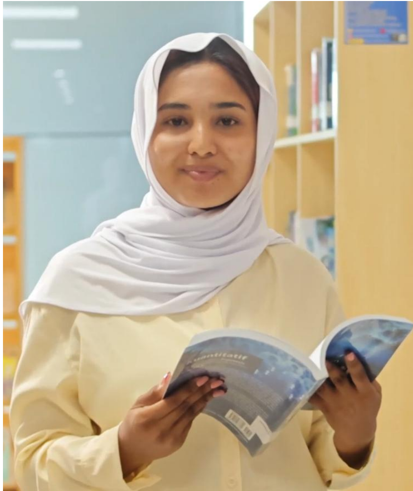
Female International Student